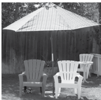
Enjoy Summer in the Square